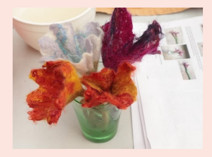
Week 1 – basic flowers but with an attached stem