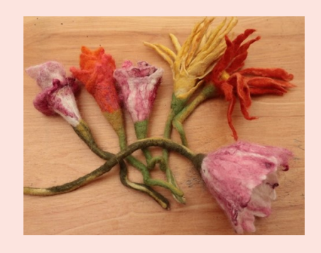
Week 2 – flowers with a resist, giving 2 layers