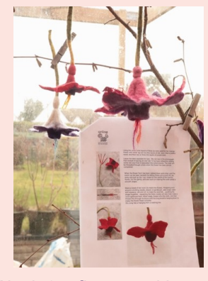
Week 2 – flowers with a resist, giving 2 layers